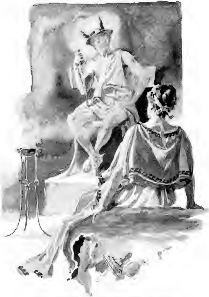
"WHAT, HERMES, BRINGS THEE HITHER!"—Page 284.